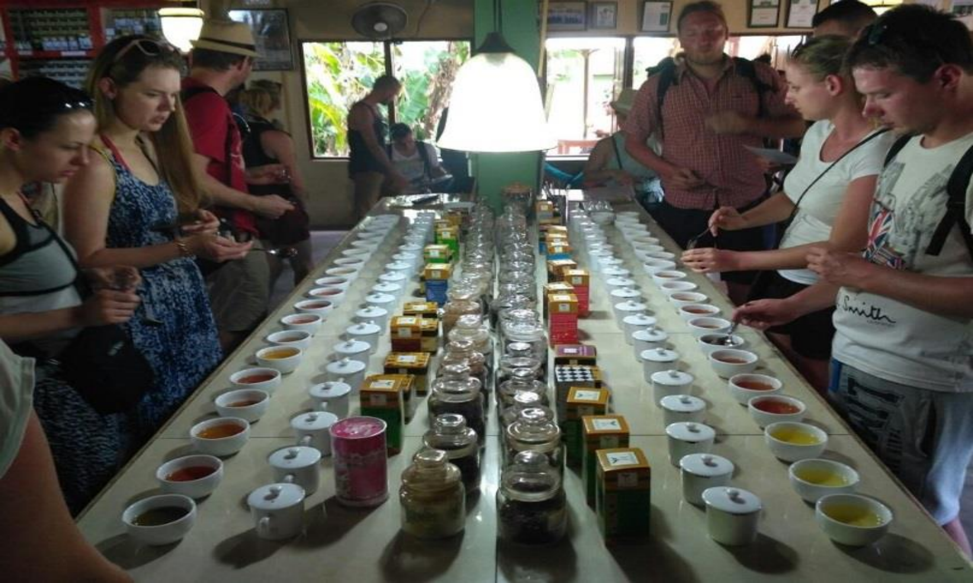
Handunugoda Tea Estate